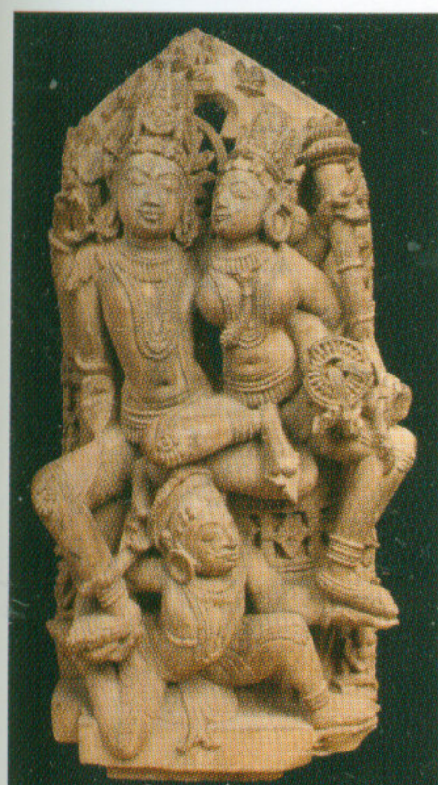
Stele India, 11th century Christophe Hioco

The 56th Brussels Antiques Fine Arts Fair (BRAFA) takes place from 21 to 30 January, with late-night openings on the 25th and 27th. For the eighth year, the event will take place in the large halls of the mail sorting station of Tour & Taxis on avenue du Port 86 ( www.brafa.be ).