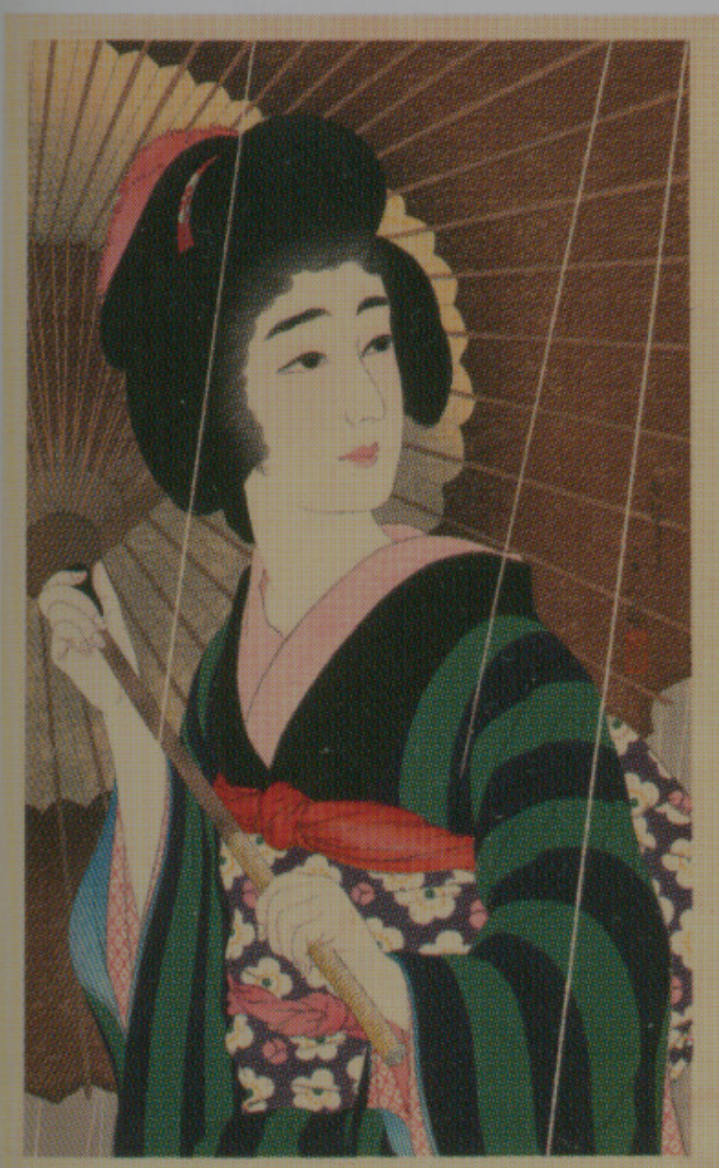
Ame By Torii Kotondo (1900-76), 1929 Galerie Tanakaya

Galerie Tanakaya will present 17th to 20th century ceramics for the