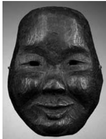
Kagura mask depicting Oto-men Japan, Edo period, c. 17th century Wood Height 16.5 cm Mingei Arts Gallery

Japanese art specialists Mingei Arts Gallery will be at the Marc Heiremans Gallery at Rue Joseph Stevens 25. Their selection includes a wood kagura mask of Kijin, an Oni god, dating to around the 14th century, and a No costume with gold embroidery from the 17th century. They will also show Edo period Oribe ware dishes and 19th century rural textiles.