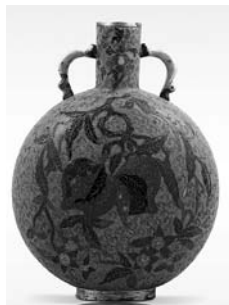
Pilgrim flask China, second half of the 16th century Cloisonné Height 26.1 cm, width 20 cm Galerie Lamy

Participating for the fifth year, Wei Asian Arts will showcase recent acquisitions of Chinese art at Rue Van Moer 5. A Tang period bodhisattva torso will be displayed, along with a Qing table screen