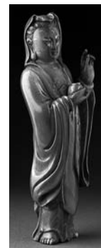
Female immortal China, Ming period (1368-1644) Ivory with traces of gilding Height 16 cm Wei Asian Arts