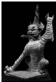
Earth spirit China, Tang period (618-906) Painted pottery Height 53 cm Bacstreet

Bacstreet will be showing both antique and contemporary works of art. The eclectic range of objects include a Japanese bodhisattva in wood, enamel and gold from the Momoyama period and a painted pottery earth spirit from the Tang period.