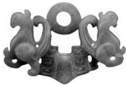
Dagger handle China, 205 BCE to 9th century CE Jade Height 5.5 cm, width 7 cm Georgia Chrischilles

Now in its fifth year, the Brussels Oriental Art Fair will take place from 4 to 7 June, with a vernissage opening on 3 June (for details, see www.boafair.be/index.htm ). The fair is fast gaining a solid reputation for the calibre of works on offer, with more than 2,500 visitors last year, including collectors from the US, Asia and Australia. Twenty-six dealers will participate, with exhibitions at spaces in the popular Sablon antiques district in the heart of the city.