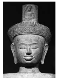
Detail of Avalokiteshvara Cambodia, Angkor Wat period, 12th century Sandstone Height 74.5 cm Raimann & Raimann