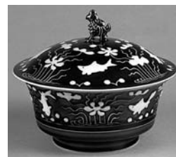
Bowl and cover China, Yongzheng period (1723-35) Porcelain with underglaze- enamel blue/ slip decoration Diameter 17.2 cm S. Marchant & Son

S. Marchant & Son have been exhibiting since 1975. Works from their Recent Acquisitions 2009 catalogue are on display. The provenanced pieces include an imperial blue-ground bowl and cover with from a European collection.