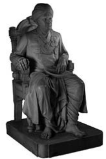
Indian nobleman By M. S. Nagappa, 1928 Marble Height 168 cm, width 85 cm, depth 110 cm Ethnologica