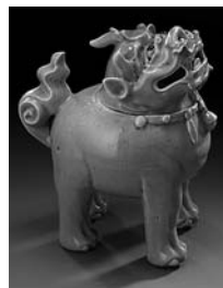
Incense burner China, Ming period, 16th century Porcelain with celadon glaze Height: 31 cm Jorge Welsh Oriental Porcelain and Works of Art

For Holland-based Vandervan & Vandervan Oriental Art , London remains a vital part of the art market and is the perfect place to maintain a yearly presence. According to Nynke van der Ven, Olympia has the space and atmosphere for them to present their collection to its full potential. Their display comprises export porcelain, Han and Tang pottery and some Japanese works of art. Highlights include a set of 15 famille-verte armorial plates from the Kangxi period depicting the members of the Triple Alliance formed by Holland, France