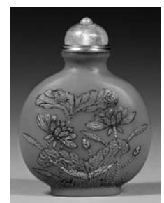
Snuff bottle China, Qianlong period (1736-95), dated 1767 Glass with enamel Height 5.5 cm Espace4