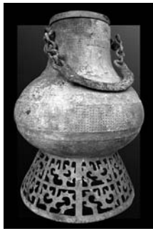
Receptacle Vietnam, Giau-chi period, c. 1st century Bronze Height 30 cm Galerie Christophe Hioco

since the beginning. This year, they will be offering an eclectic mix of Chinese snuff bottles, Japanese works of art and samurai art at Rue de Rollebeek 32. Rounding out their display will be a selection of boxes and chests from the Asian and Islamic world.