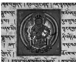
Detail of an illuminated folio showing a red bodhisattva Western Tibet, 11th century Paper, gold and pigment Length 68 cm, width 24 cm Carlo Cristi