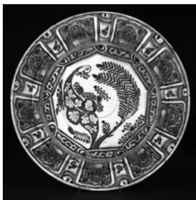
Dish Iran, Safavid dynasty, c. 1700 Ceramic with underglaze- blue decoration Diameter 44 cm Galerie Alexis Renard