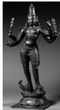
Skanda with peacock India, Tamil Nadu, Vijayanagar period, 16th century Bronze Height 74 cm Marcel Nies Oriental Art

Marcel Nies Oriental Art of Antwerp will show sculptures and other objects, mainly from old collections, at