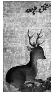
Detail of a screen showing a stag Japan, Rimpa School, Edo period, 18th century Two-fold screen, ink and colour on gold-ground paper Height 170 cm, width 190 cm Gregg Baker Asian Art

Objects specially chosen for the fair's anniversary will be on view at Gregg Baker Asian Art's stand. Among the Japanese screens are two examples of the 17th century depicting horses in stables and scenes from Okuni Kabuki, respectively. The 18th century work of the Rimpa School is represented by a two-fold screen decoratively painted with a stag and doe amongst bamboo under a maple tree.