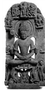
Vishnu India, Madhya Pradesh, 9th/10th century Sandstone Height 112 cm Renzo Freschi

Myrna Myers will be presenting an exhibition of Indian jewellery from the collection of London-based dealer Susan Ollemans . Polychrome enamelled examples from the Mughal courts include