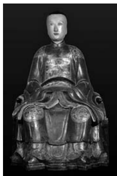
Dignitary China, c. 1800 Plaster Height 97 cm Vandervan & Vandervan Oriental Art

This year's Olympia International Art & Antiques Fair in London will be held from 5 to 14 June, with a collector's preview on 4 June. With about 250 participants, a huge range of material is available, and there is a vetting panel of 200 experts to ensure quality (see www.olympiaartsinternational.com/ for details).