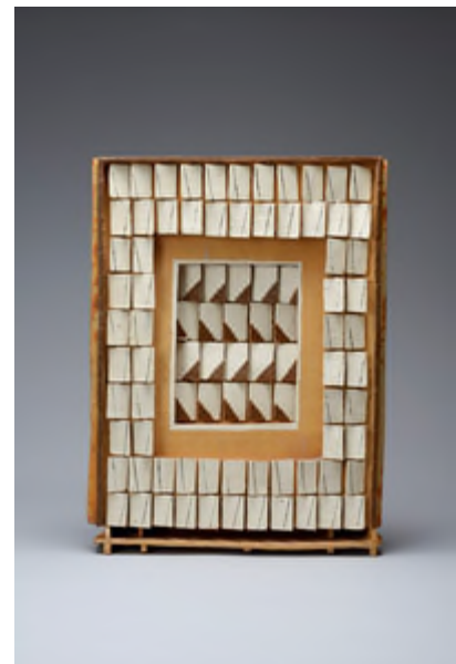
Screen-style sculpture, Tôhen Mandara, 1973

Galerie Jacques Barrère (France), Santos-London (England), and U.S. galleries that include Andrew Kahane, Ltd., Asian Art Studio, Ralph M. Chait Galleries, Inc., China 2000 Fine Art, The Chinese Porcelain Company, Michael C. Hughes LLC, Jadestone, Kaikodo LLC, J.J. Lally & Co., M. Sutherland Fine Arts, Ltd., Nicholas Grindley Works of Art Ltd, and Zetterquist Galleries.